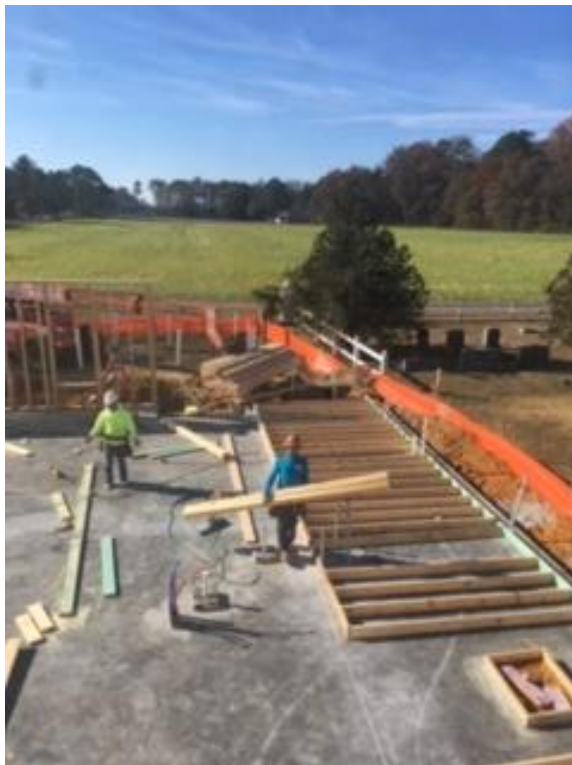
Matching Gift - 2 for 1 match

Please bear in mind that any new contributions outside of already pledge amounts will count double, if received before December 31st!