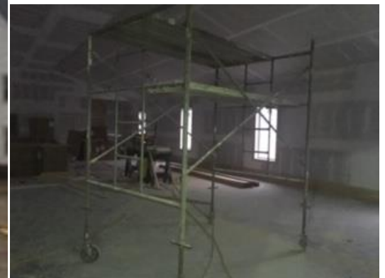
Sneak preview of the inside