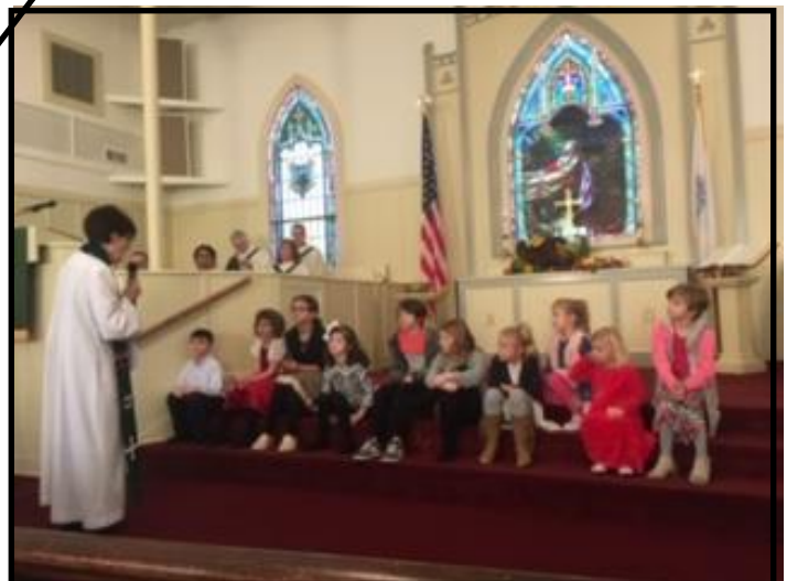
The Children's Message during Sunday Worship