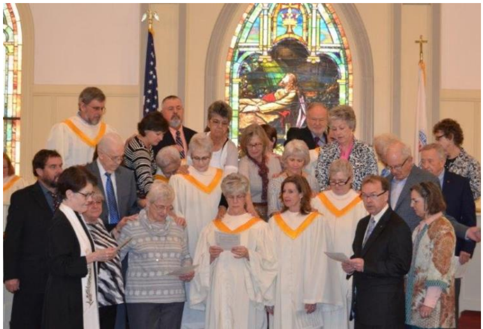
Laying of Hands by all of our ordained deacons.