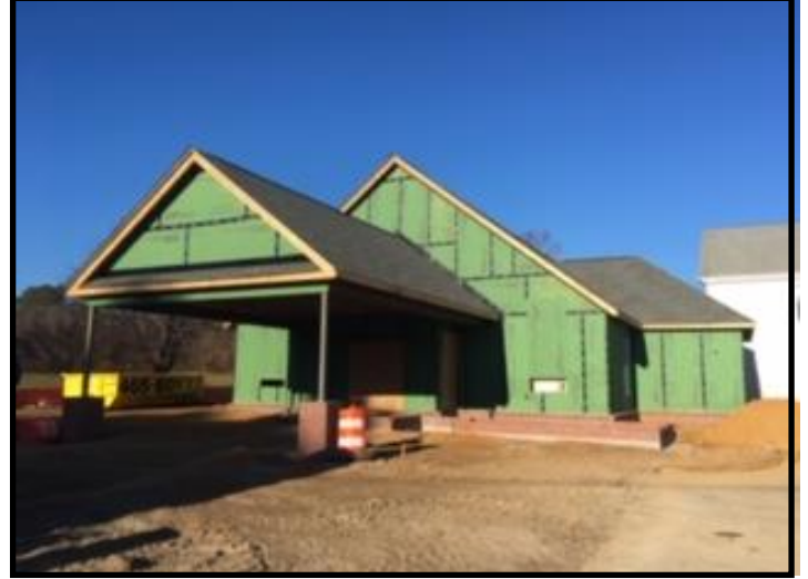
Shingles delivered and they are on! Our Contractor is moving right along!!