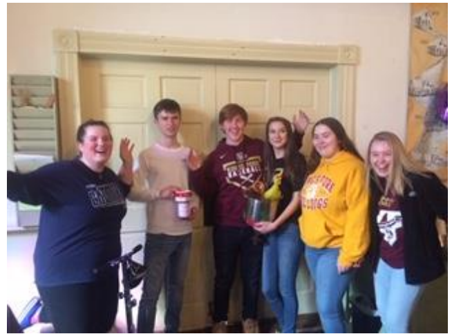
Winners from 2019