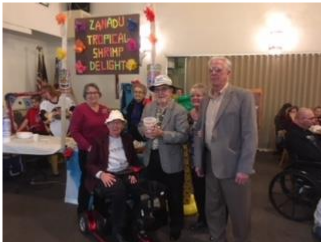
Winners from 2018

Proceeds go to the Becky Godwin Memorial Scholarship Fund