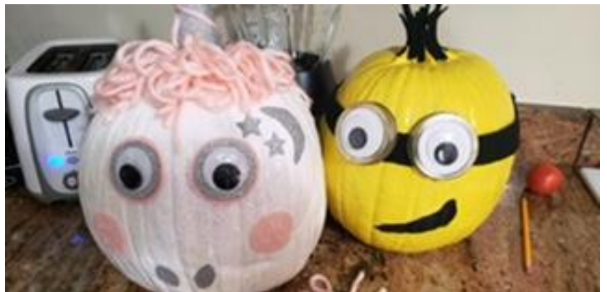
Runners up - The Burgess Family