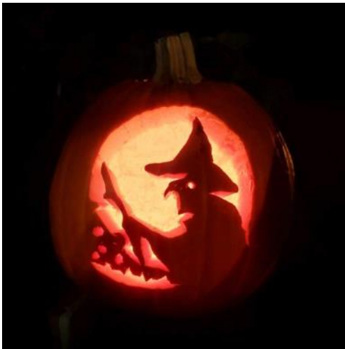
Winners - The Wilson Family Witches Brew