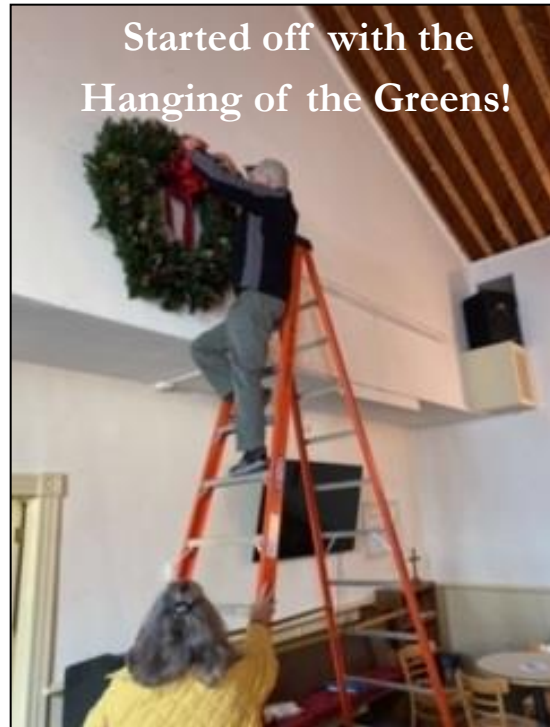
Started off with the Hanging of the Greens!