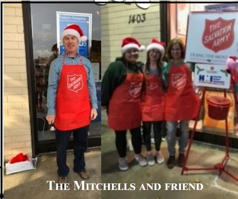
THE MITCHELLS AND FRIEND