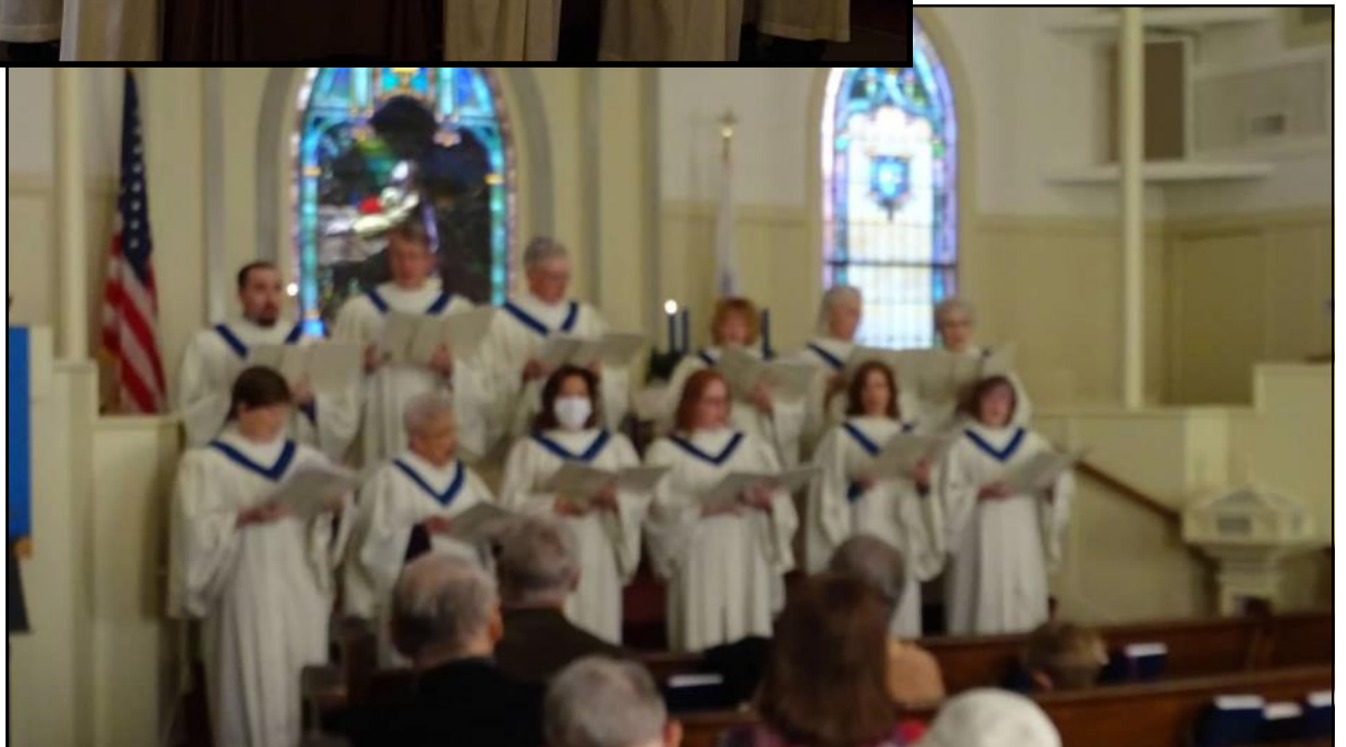
The Chancel Choir