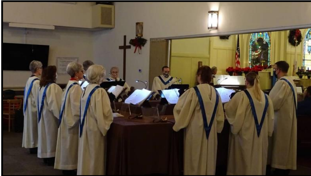
The Bell Choir