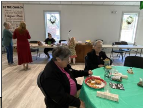
Church Advent Activity