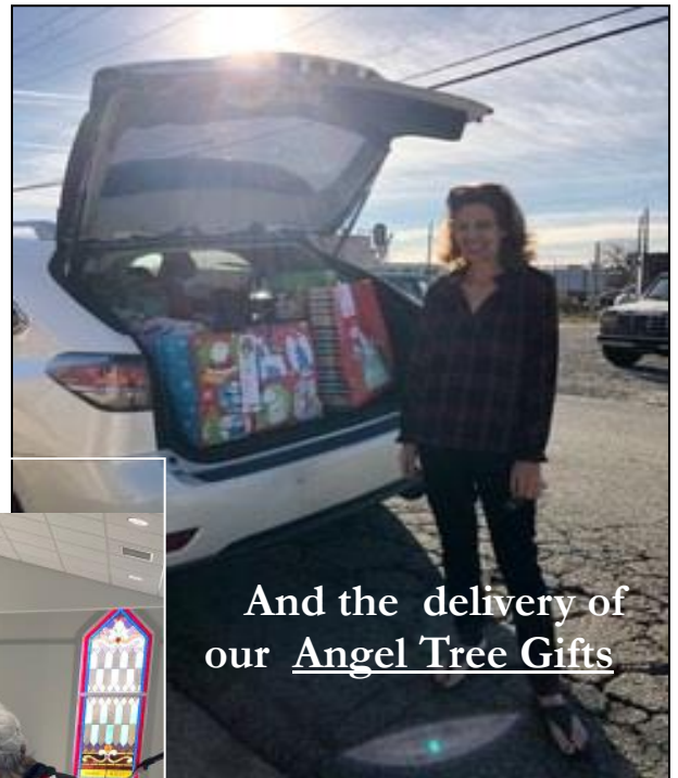
And the delivery of our Angel Tree Gifts