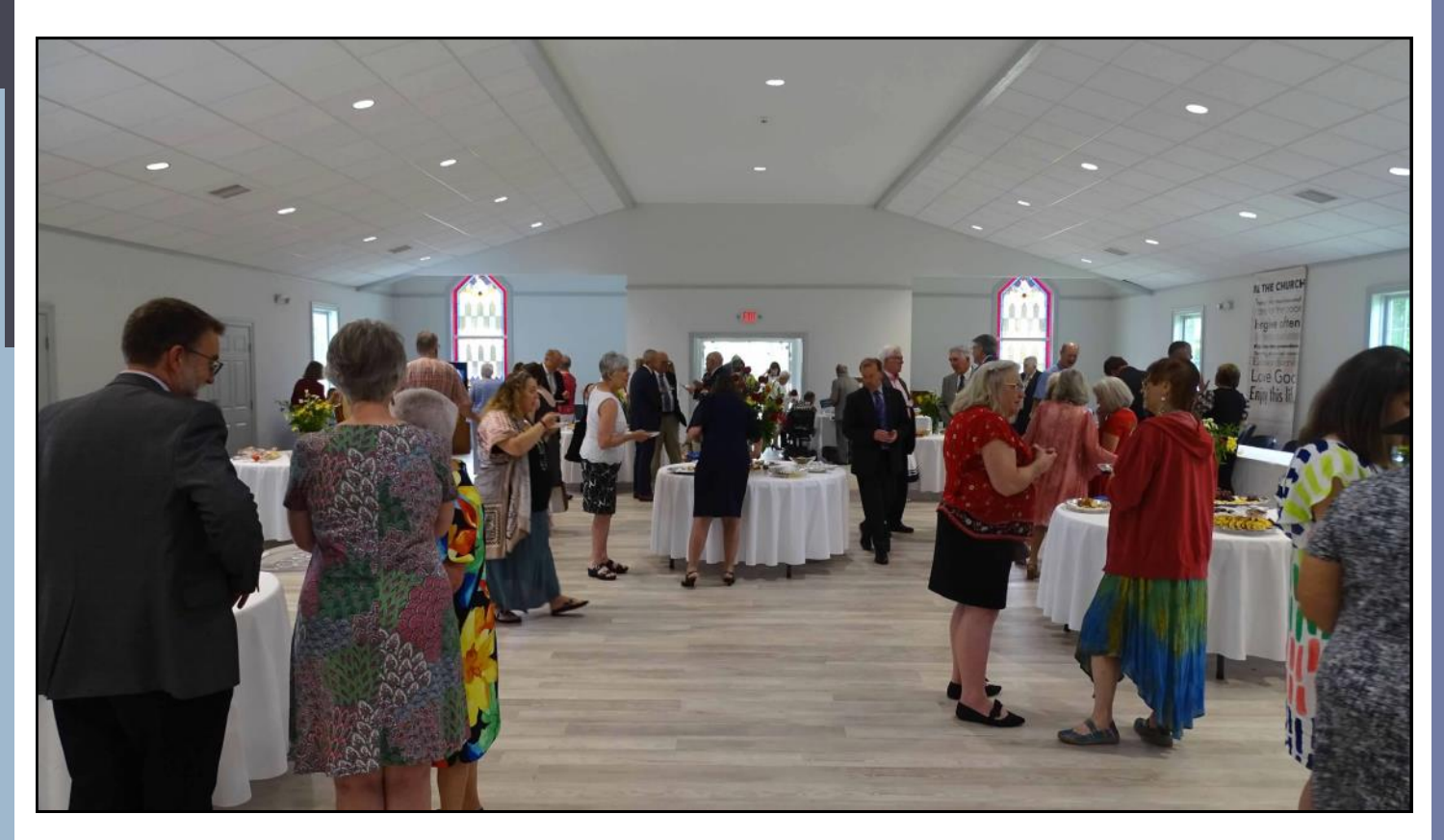
And God's bounty was enjoyed!