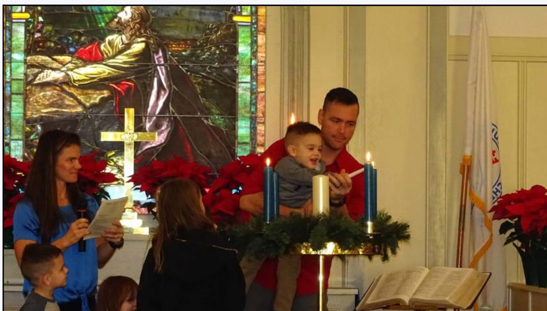
Lighting of the Fourth Advent Candle