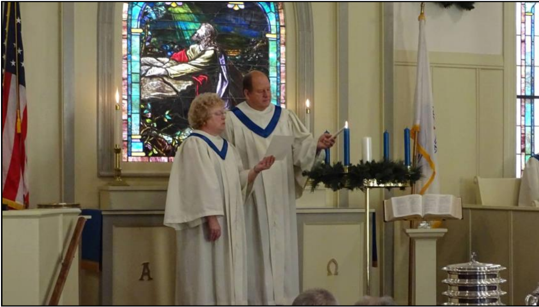
Lighting of the Second Advent Candle