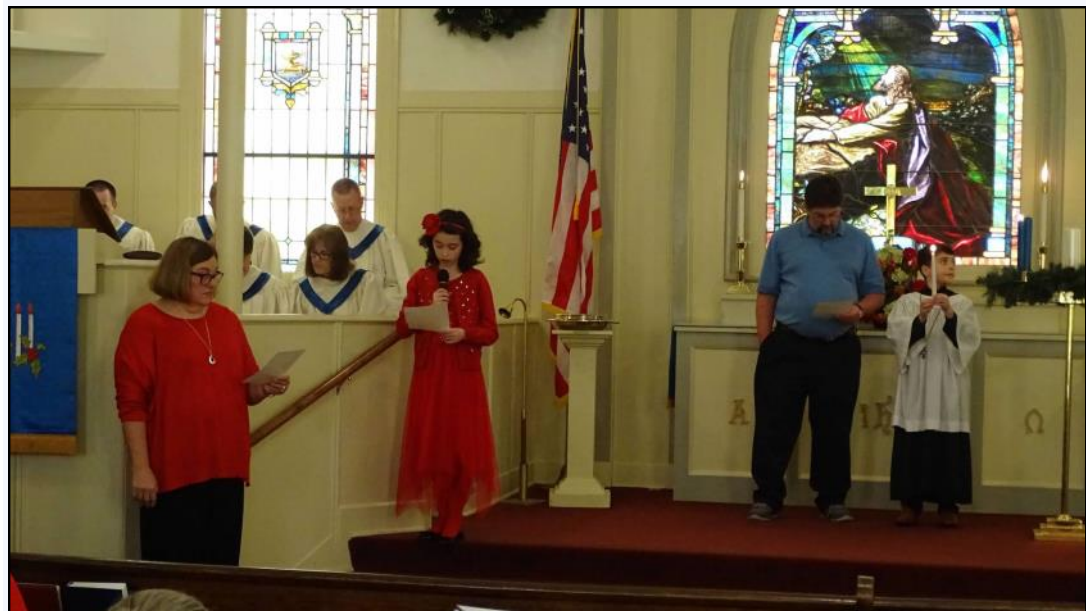
Lighting of the Third Advent Candle