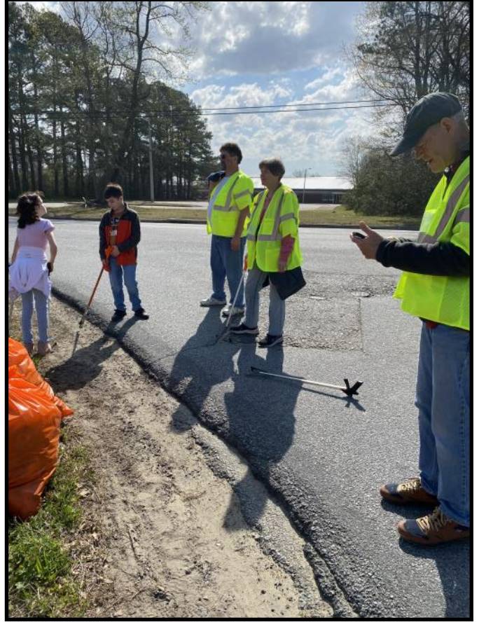
Thank you to Oakland folks who helped with the Great Suffolk Clean Up!