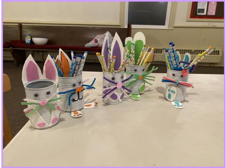
Youth Group Friday Friends Craft