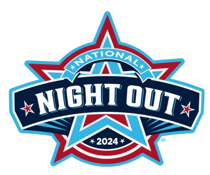
POLICE - COMMUNITY PARTNERSHIPS

Oakland Christian UCC served treats including cotton candy and snow cones at National Night Out on Aug. 6. This event at Oakland Elementary School helped build relationships and celebrate what makes our area special.