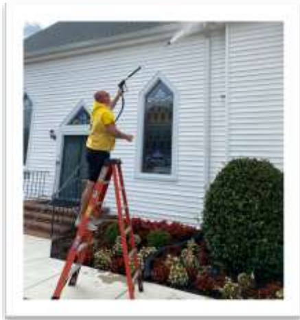
Cynergy Pressure Washing cleaned the entire building recently.